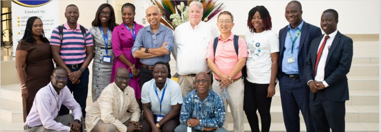
CARISCA team members from Arizona State University and Kwame Nkrumah University of Science and Technology gather in Kumasi, Ghana, before the start of the 2022 Supply Chain Research Summit.