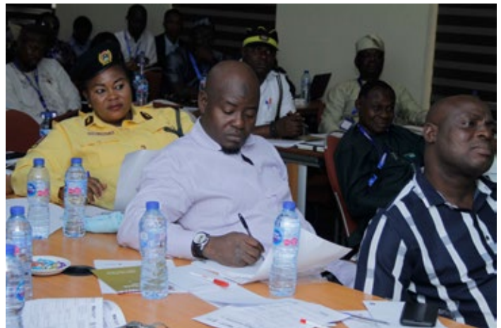
Transport and logistics experts gather in Lagos to discuss improvements to Nigeria's urban transport systems.