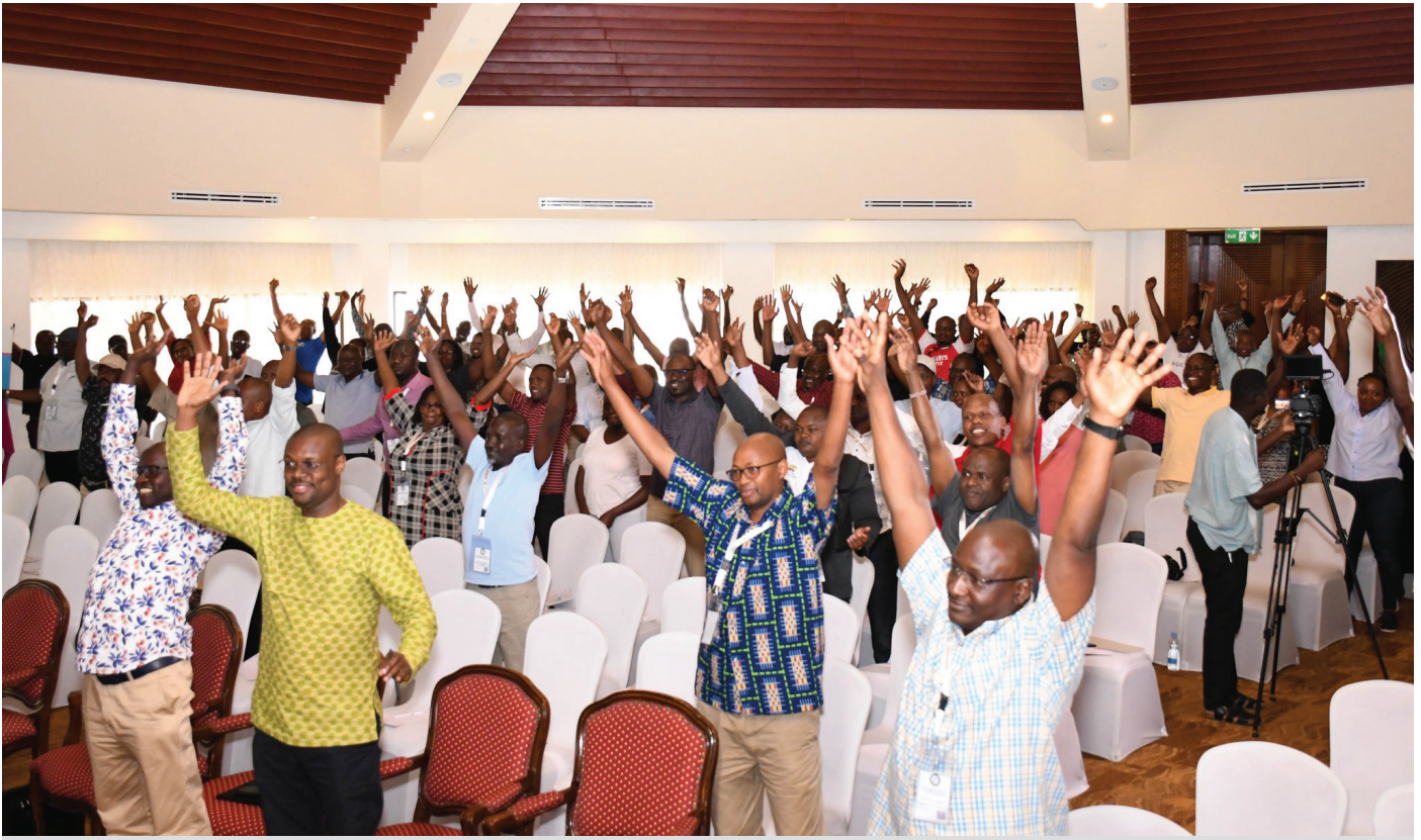
SCM Professionals during a past workshop

The customized in-house training programmes are designed to equip practitioners and stakeholders with practical skills and knowledge to carry out procurement within the confines of prevailing procurement law and guidelines, while promoting professionalism and best practice in SCM practice. This helps to increase overall organizational effectiveness through the application of tested procurement and supply chain management concepts.