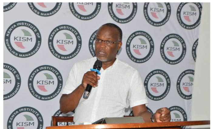
such as pandemics, budget constraints, and logistical hurdles.

Throughout the conference, participants explored a range of topics, including emerging trends in supply chain technology, public-private partnerships, and the integration of county health supply systems into the national framework. The collaborative nature of the event reinforced the shared responsibility across sectors to build resilient health supply chains that can withstand challenges