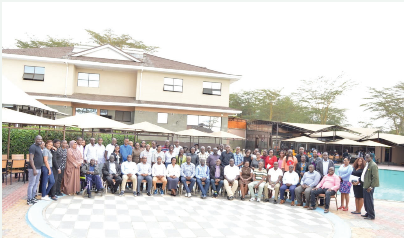
Participants following through a session during the procurement training for Committees, CECs, and User Departments on 27th September 2024 in Naivasha

The Procurement Training for Committees, CECs, and User Departments successfully concluded today, 27th September 2024, in Naivasha after an intensive five-day session aimed at strengthening procurement processes across counties. Attendance comprised of County Executive Committee Members (CECs), procurement committees, and other key stakeholders, focused on building capacity to ensure more efficient, transparent, and ethical procurement practices within county governments and public institutions.